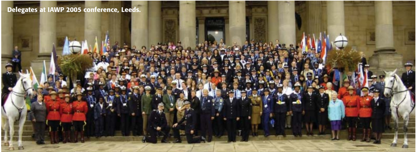
Delegates at IAWP 2005 conference, Leeds.