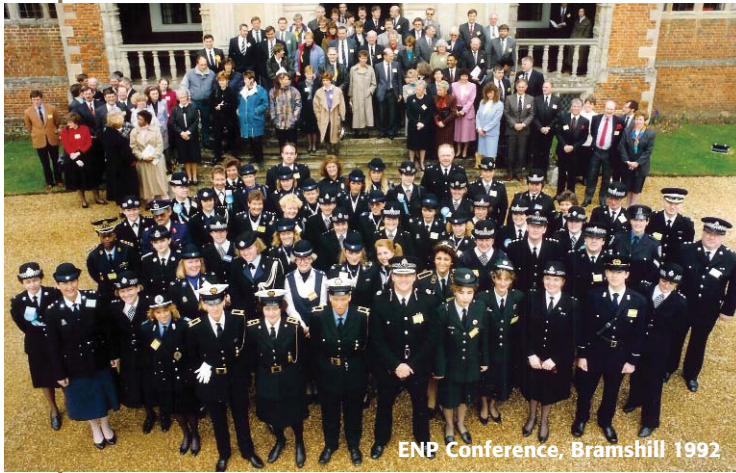
ENP Conference, Bramshill 1992