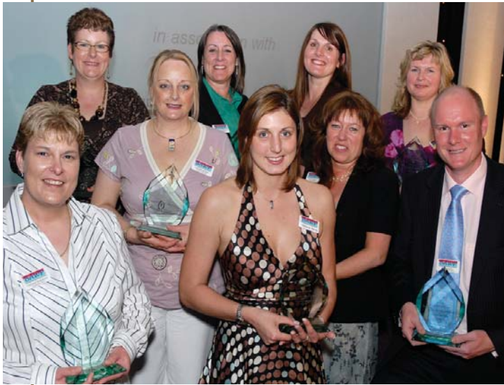
BAWP Award winners 2007

Building Alternative Working Practices; and Women's Health.