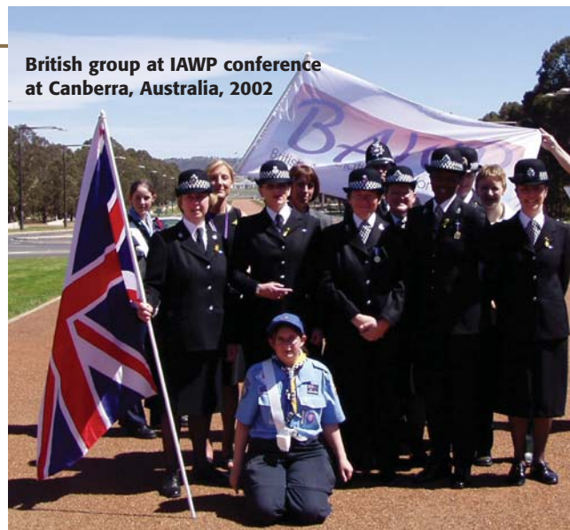
British group at IAWP conference at Canberra, Australia, 2002